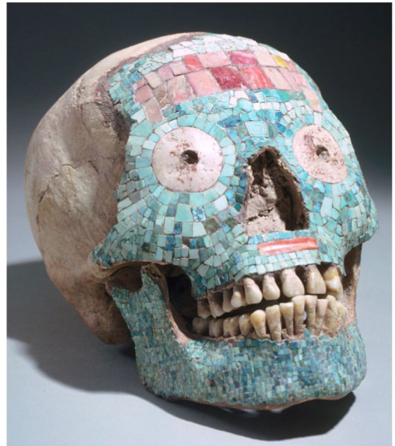
Fine Arts Museums of San Francisco